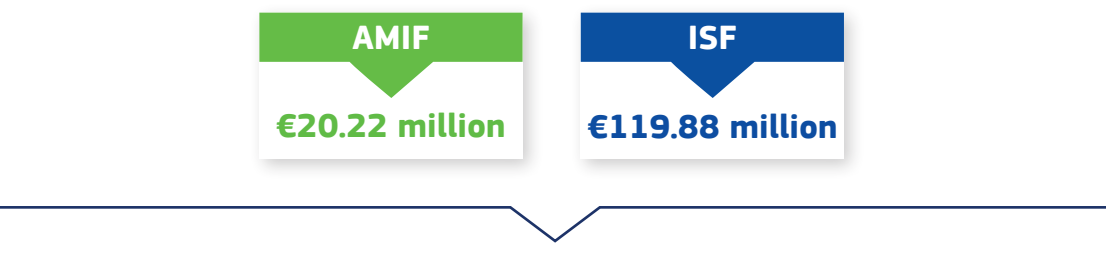
Since 2015, €140.1 million has been allocated, of which, €48.1 million paid.

The majority of EU funding under the Asylum, Migration and Integration Fund as well as the Internal Security Fund is allocated to a Member State's national authorities at the beginning of each long-term EU budget period. EU funding for the current period (2014-2020) is managed and implemented by Member States' authorities through national programmes agreed with the Commission.