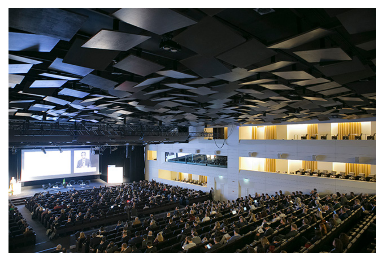
The SRE 2018 continued with two High-level panels on "Demonstrating the impact of security research – challenges and barriers" and on "Projects after life" where lively discussions took place between panellists representing a broad variety of relevant stakeholders.