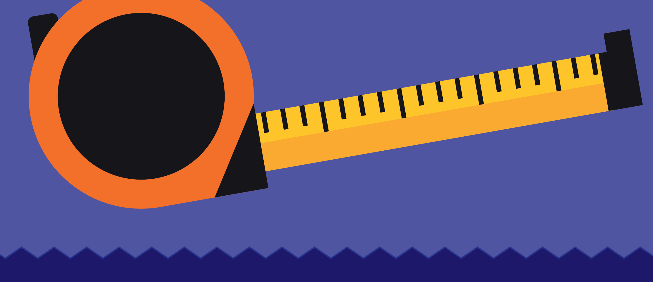
Involve practitioners and consider qualities like respect and empathy

Establish the goals of the EXIT programme and how these will be measured