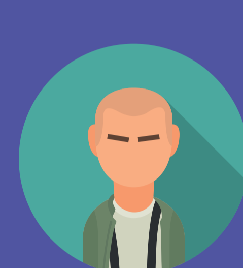
Angry and frustrated misfits