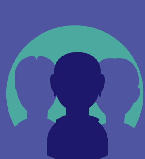
Drifters and followers