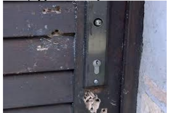
Below - Fire arms attacker outside New York church