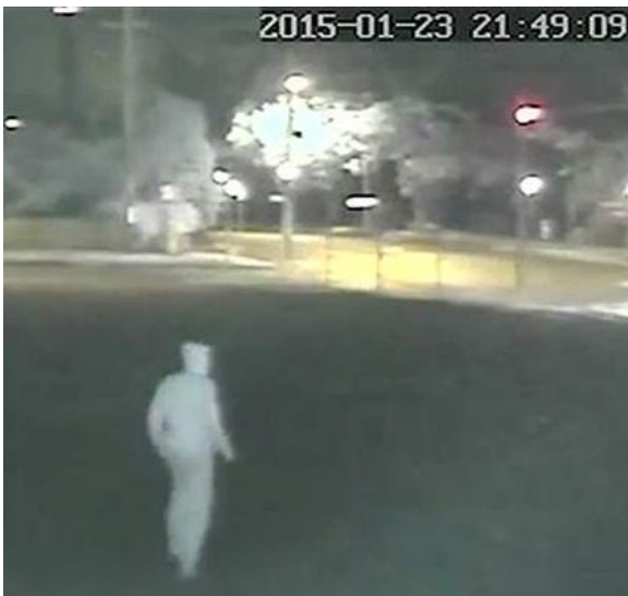
CCTV of Mosque firebomber in Australia.

l) Is your CCTV capable of monitoring key areas and allows the staff to identify possible strange behaviour? Is the CCTV continuously monitored by trained staff to enable detection of suspicious acts ? Otherwise, such tool should be considered as a tool that may aid post crime investigations (theft and other types of crime). Is there an access control system which is linked with CCTV monitoring? Could CCTV monitoring allow you to respond and protect your facility?