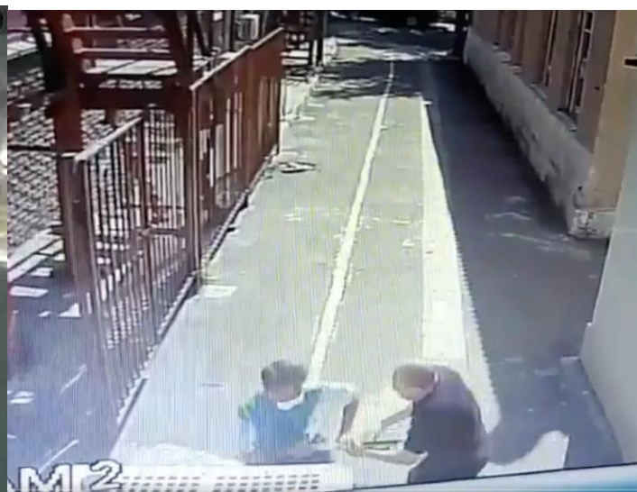
Security fighting with axe attacker outside Ukrainian Synagogue