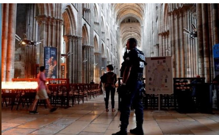
Police officer inside church after the terrorist attack and murder of a priest in church attack in Rouen