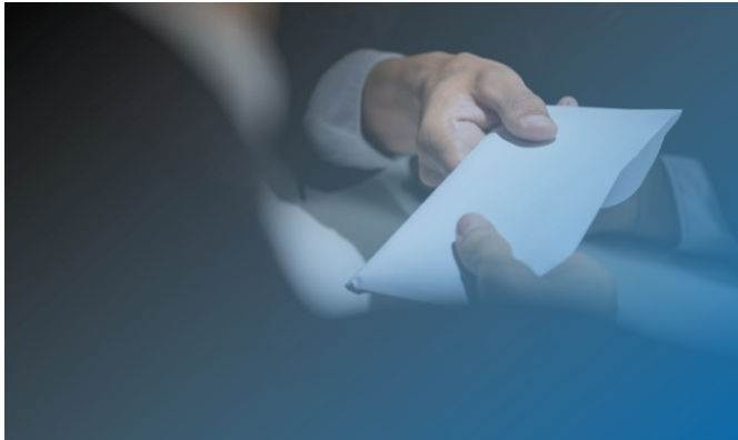
C haracter of corruption