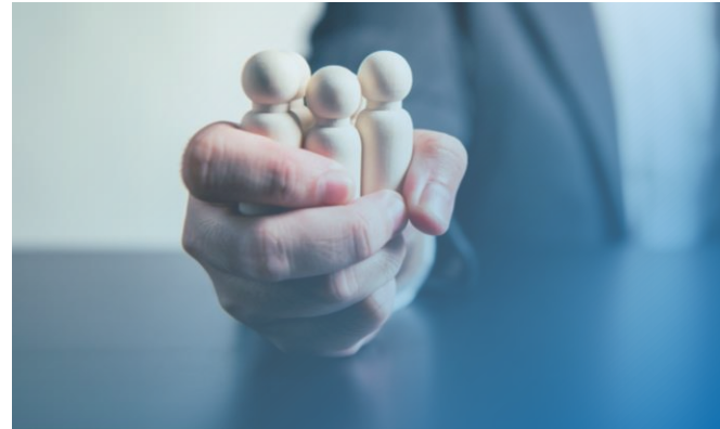
C auses of corruption