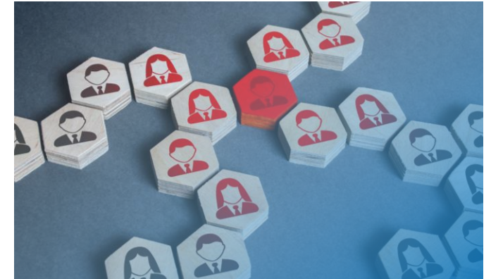
C onsequences of corruption