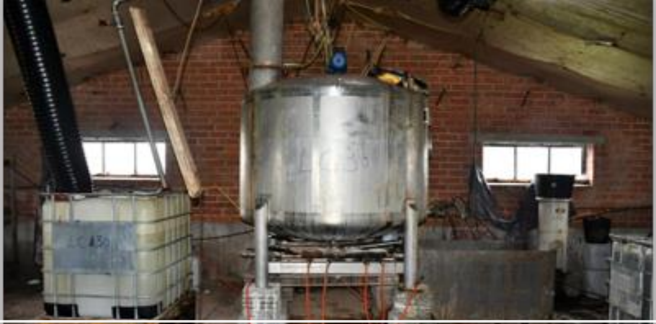
Production of synthetic drugs in Belgium