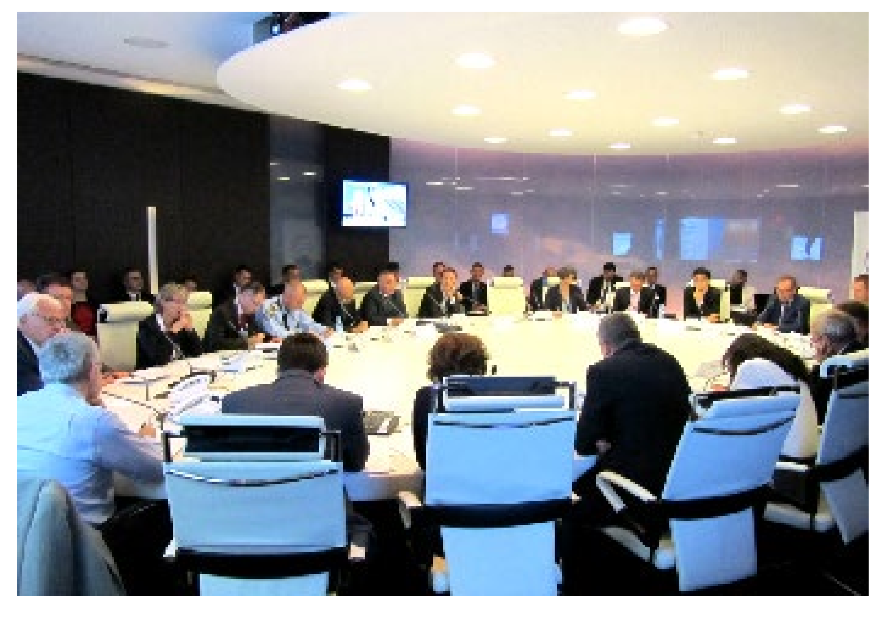
Inter ministerial crisis maangement