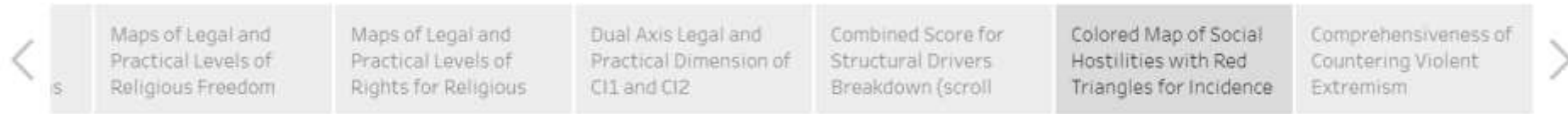
CI3: Colored Map of Social Hostilities with Size of Triangles for Incidence of Terrorism