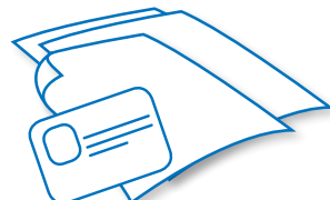
Consular officers dealing with visas