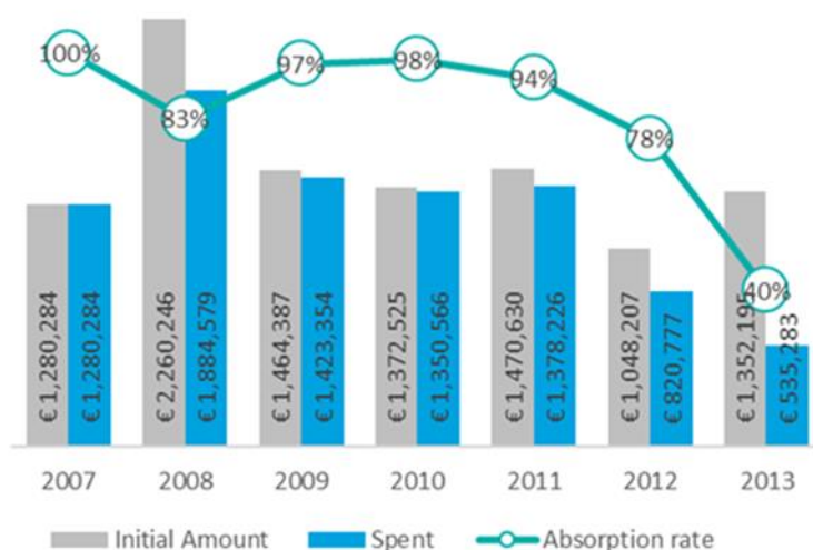
Figure 2 Initial procurement amount committed, paid and absorption rate across the period 2007-2013 by 31 March 2017

Source: ICF analysis of DG Budget ABAC data.